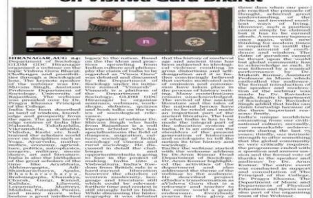
Deptt of Sociology GLDM GDC Hiranagar organizes webinar on Vishwa Guru Bharat