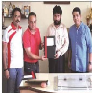
Dignitaries signing memo of understanding.

The entire MoU was planned and executed under the able guidance of